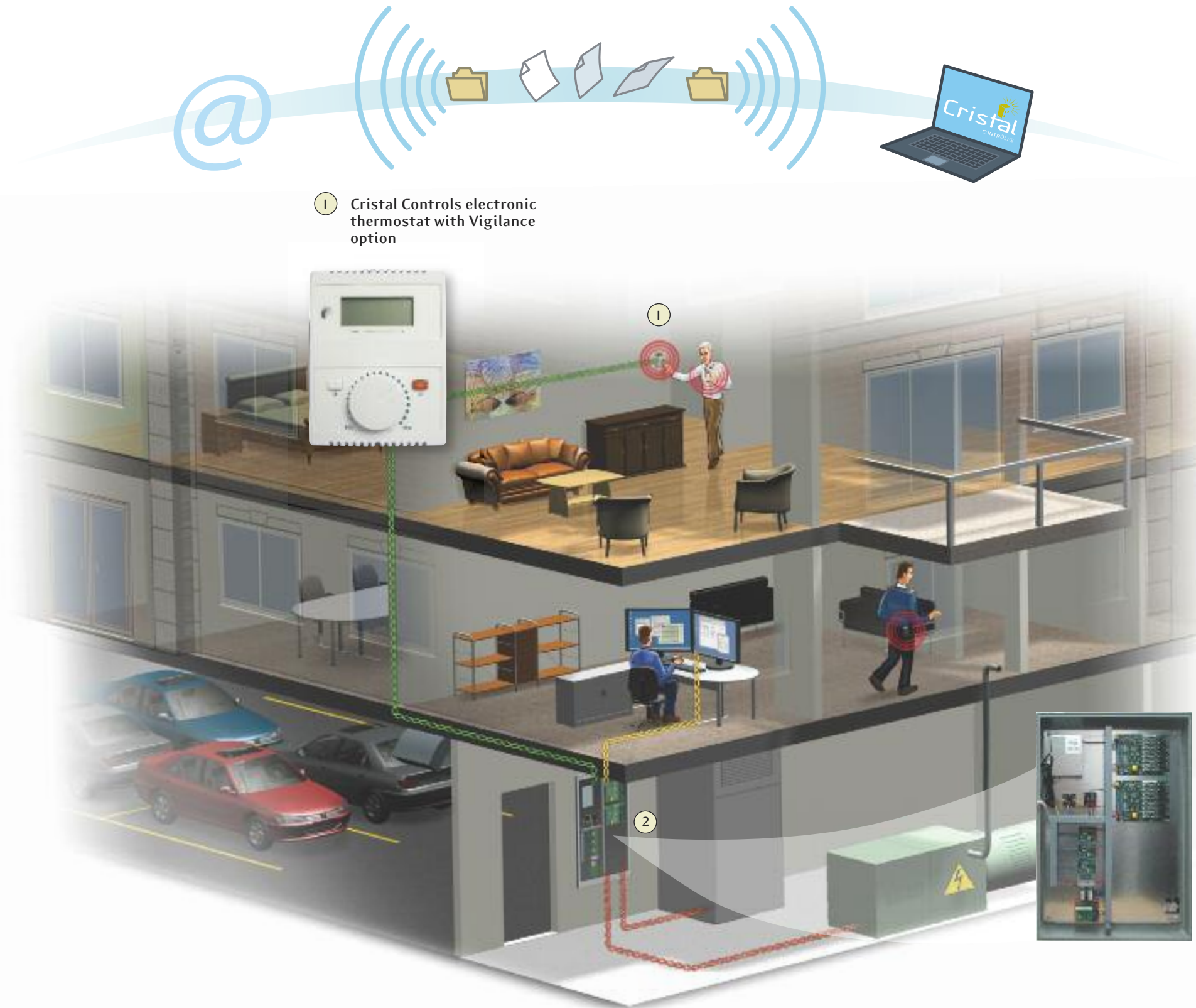
1 Cristal Controls electronic thermostat with Vigilance option

With Cristal Controls' energy management systems you will save: